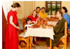
Dining in Roman dress

In the tavern of the Roman villa, our chefs prepare Roman specialities based on recipes drawn up by the gourmet Marcus Gavius Apicius. The menu also includes a wide selection of regional dishes. For a small charge you can even dine in a Roman tunic. Both the tavern and the "Great Hall" with its unique atmosphere are ideal for festivities involving up to 120 people. Whether for a family celebration, business trip or conference, the villa represents the perfect setting.