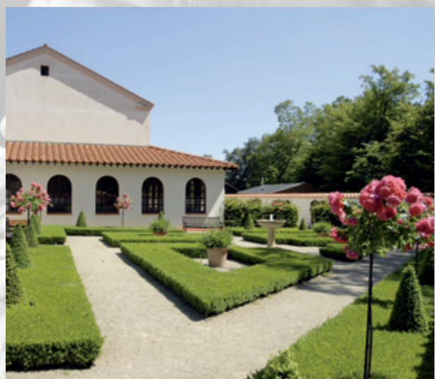
The rose room at the manor

In June 2000 the villa complex was expanded in the wake of the EU project "Gardens without Limits". Six gardens were created on the complex site: the courtyard garden, the herb garden, the rose room, the fruit garden, the vegetable garden and the flower garden. The scent of roses, herbs and flowers and the sight of the box tree-lined courtyard with the pool in the middle all hint at past splendour. At the Roman Villa Borg the ancient garden world of the Romans is brought back to life.