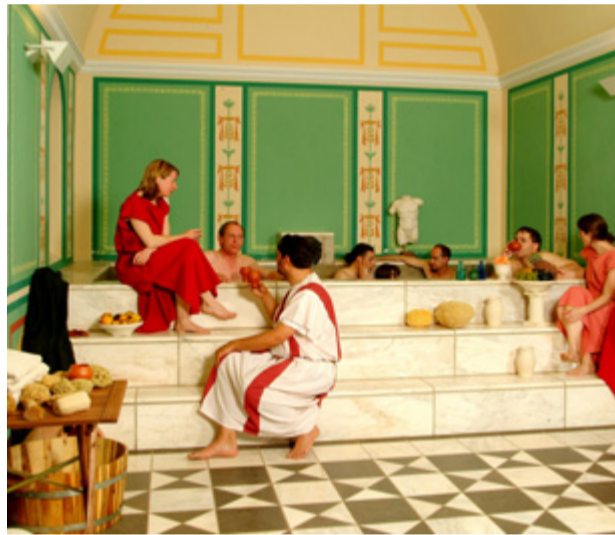
The hot bath

Learn all about and be impressed by the ancient Roman baths. The villa baths are the most interesting historical part of the villa. From the entrance area you reach the cold bath with its large pool. Next to it - in line with ancient bathing customs - is the vaulted room containing the hot bath. The other rooms were used for relaxation and conversation. The villa baths were heated using the Roman floor heating system called the hypocaust. The way in which a hypocaust is constructed is explained in one of the corners of the room. The boiler room, which is located to the side and which houses the hot water boiler, can be reached through a separate entrance at the rear of the building. The villa baths with their Roman ambience can be hired for events on request.