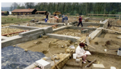
First foundations of the new baths