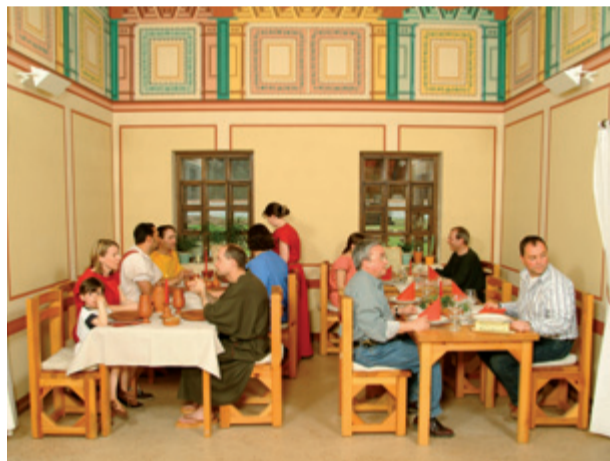
Dining room in the tavern