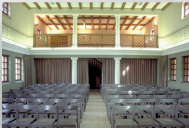
Large hall in the residential building and workshop area

Only the outside appearance of the reconstructed residential building and workshop area is similar to its ancient predecessor. Inside the rooms have all been designed in line with current requirements, and accommodate cultural events, meetings and conferences.