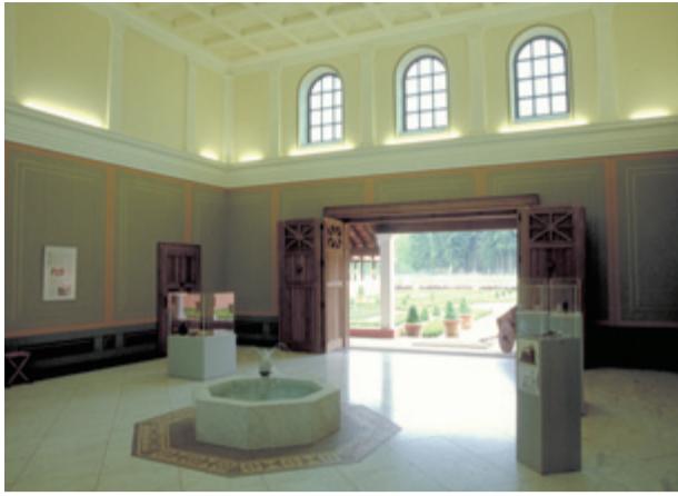
Reception hall in the manor

The manor, the main building in the complex, was and is the structure on which the entire villa complex is focused. Like the Roman Villa Nennig, the reception hall had a large mosaic floor, in this case in black and white. The remains of a coloured mosaic were found in one of the adjacent rooms. The mosaics, marble, and wall compositions of pilasters and cornices all hint at the grandeur of ancient times. The picturesque designs seen in the manor and baths are partly based on original archaeological finds in Borg, and the furniture, doors, windows, hot water boiler in the boiler room, and many of the technical details inside the villa are all exact reproductions of the Roman originals. The rooms of the manor are today used as a museum, in which the most important finds from Borg are displayed. Civil weddings are also held here.