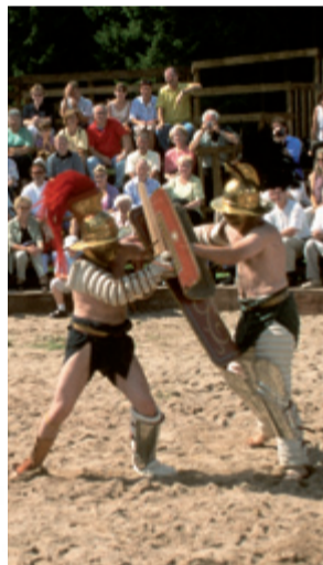
Gladiator fight during the Roman Days

The Roman Villa Borg has a year-round programme of events and festivals for young and old alike. From an "Exclusive bathing evening", through "Roman wine tasting with the slave Jatros" to "Cooking like the Romans", there is something that is sure to appeal to everyone. During the "Roman Days" - the annual highlight – visitors are transported back 2000 years to ancient Rome with its merchants, craftsmen, legionnaires and gladiators.