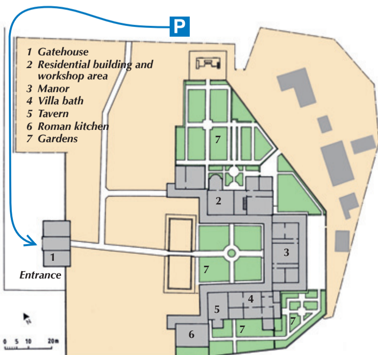
Plan of the site